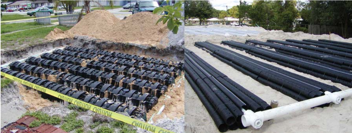
A plastic chamber drainfield.