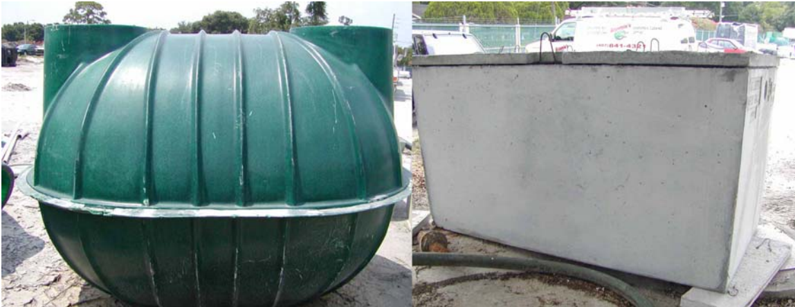
A fiberglass septic tank.